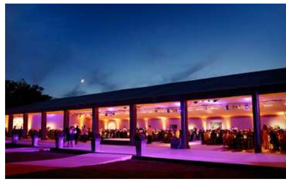
FETE DE LA FLEUR AU CHATEAU D'ISSAN